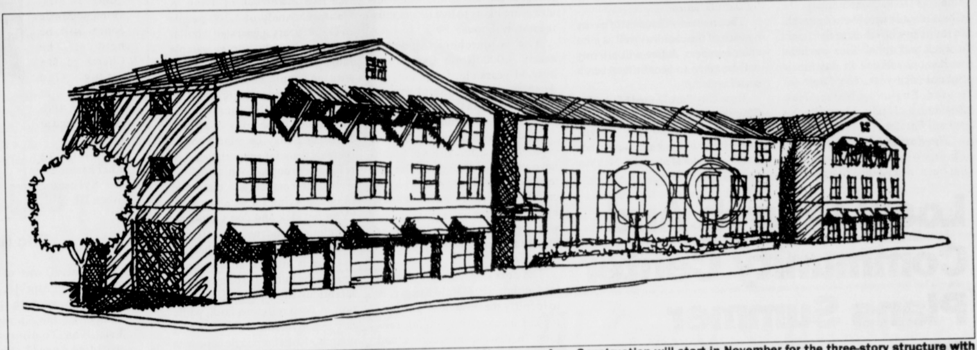
Right now, there is a vacant 27,000 square foot lot at N Killingsworth Street and Vancouver Ave. Construction will start in November for the three-story structure with 40 middle-income housing units and 4,200 square feet of retail space.

With land use approval and financing in hand, developer Jane Olberding needs a few businesses and residents to occupy her new building.