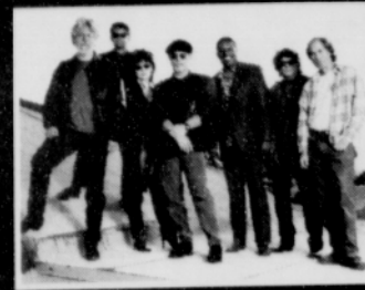
Little Feat Friday, Aug 6th