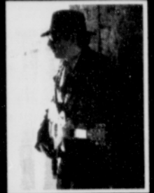
Ronnie Earl & The Broadcasters Friday, Aug 6th