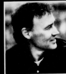
Bruce Hornsby Sunday, Aug 8th