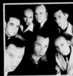
Royal Crown Review Sunday, Aug 8th