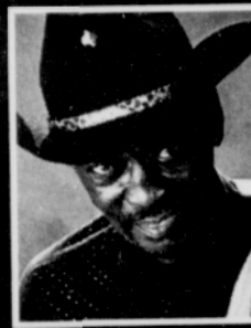
Clarence Gatemouth Brown Big Band Saturday, Aug 7th