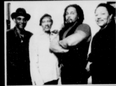
Neville Brothers Friday, Aug 6th