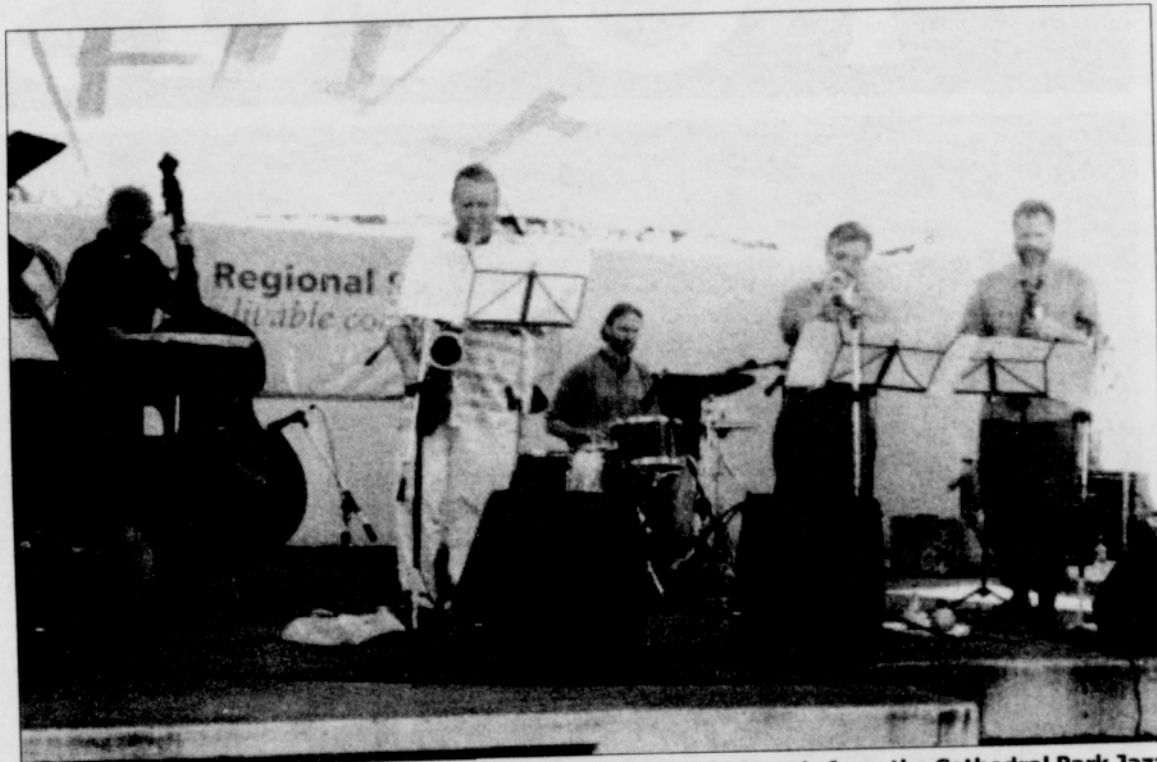
Concert goes bask in the summer sun and enjoy the sound of music from the Cathedral Park Jazz Festival.

The Jewish Federation of Portland and The Mittleman Jewish Community Center present