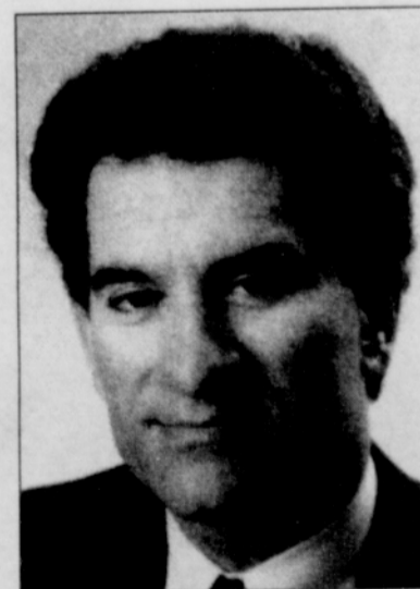
Jim Franseconi COMMISSIONER CITY OF PORTLAND PARKS & RECREATION