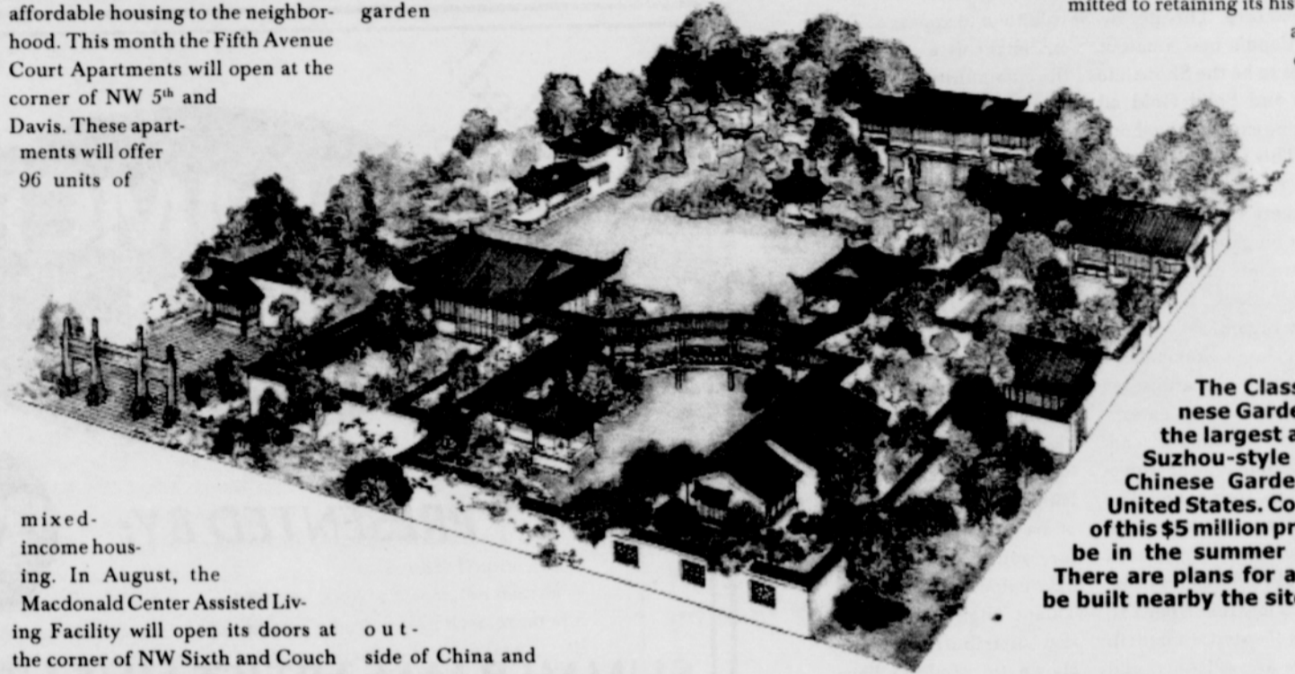
The Classical Chinese Garden will be the largest authentic Suzhou-style classical Chinese Garden in the United States. Completion of this $5 million project will be in the summer of 2000. There are plans for a hotel to be built nearby the site.

vibrant 24-hour, mixed-use, urban neighborhood, rooted in a rich historical past." Although there is plenty of "new" influx in "Old" Town/Chinatown, the neighborhood is committed to retaining its historic flavor and unique character. A primary goal of