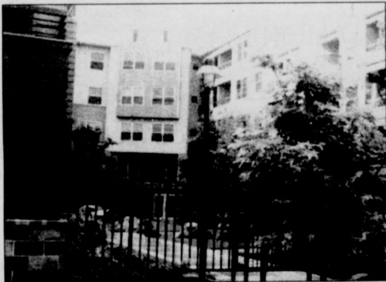
The Union Station Housing is part of a mixed-income, 700 unit dwelling project coordinated by the Portland Development Commission. A pedestrian walkway will be built over the south side of the Union Station tracks for the apartment residents so that they can easily get to bus malls and connect with the rest of the neighborhood.

the neighborhood's Development Plan - scheduled to go before Council in the Fall - is to preserve the existing mix of uses within the area as well as the historic and cultural con-