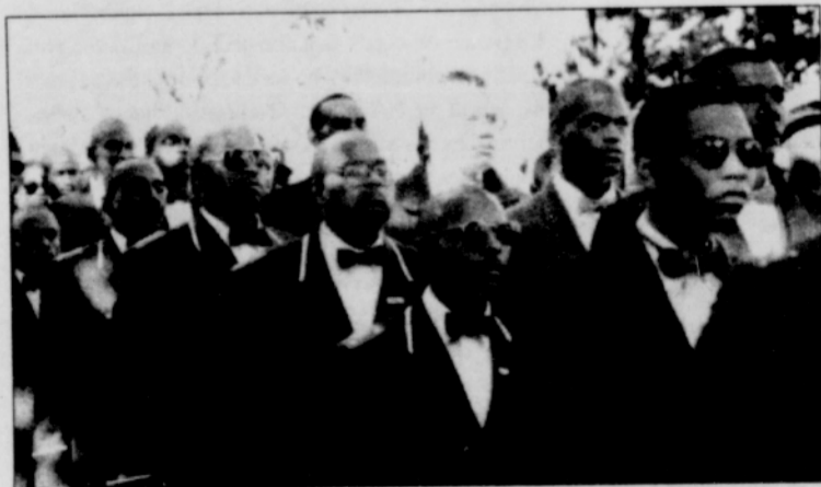
Rev. Louis Farrakhan and his devotees were sponsors of this massive demonstration.