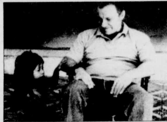
An unidentified Vietnamese actress (left) and James Hager (HARVEY KEITEL) (right). The G.I. returns to Vietnam in search of his daughter.