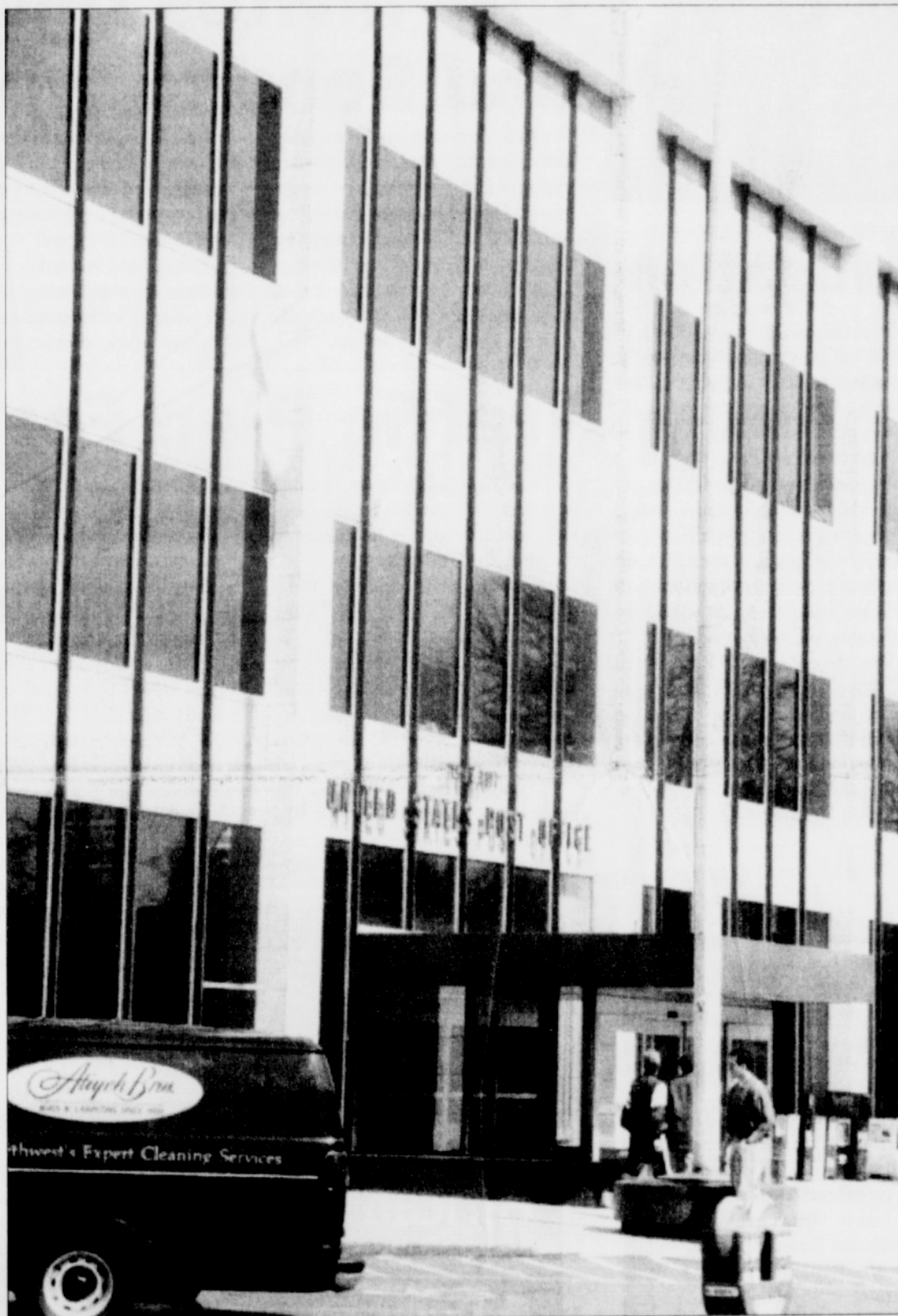
The Portland Main Post Office at 715 NW Hoyt St.

The Postal Service will collect and postmark income tax returns until midnight Thursday, April 15, 1999, at several locations around Oregon and Southwest Washington to assist last-minute filers.