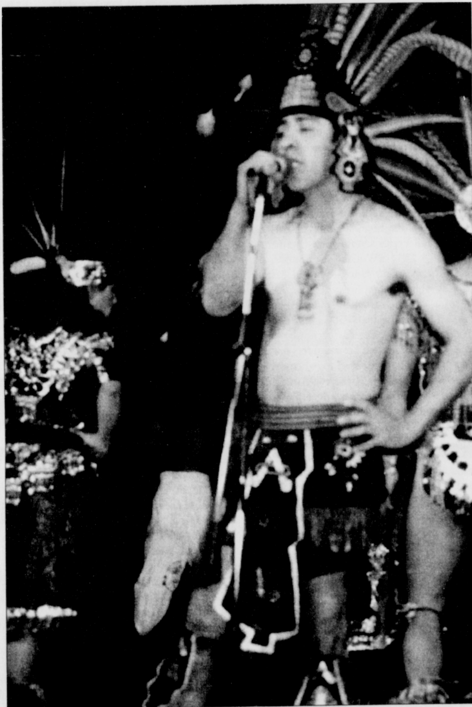
Hispanic and Native Americans gathered at Linfield College for "An Afternoon of Wisdom of the Elders." For more details, see El Observador de Portland section