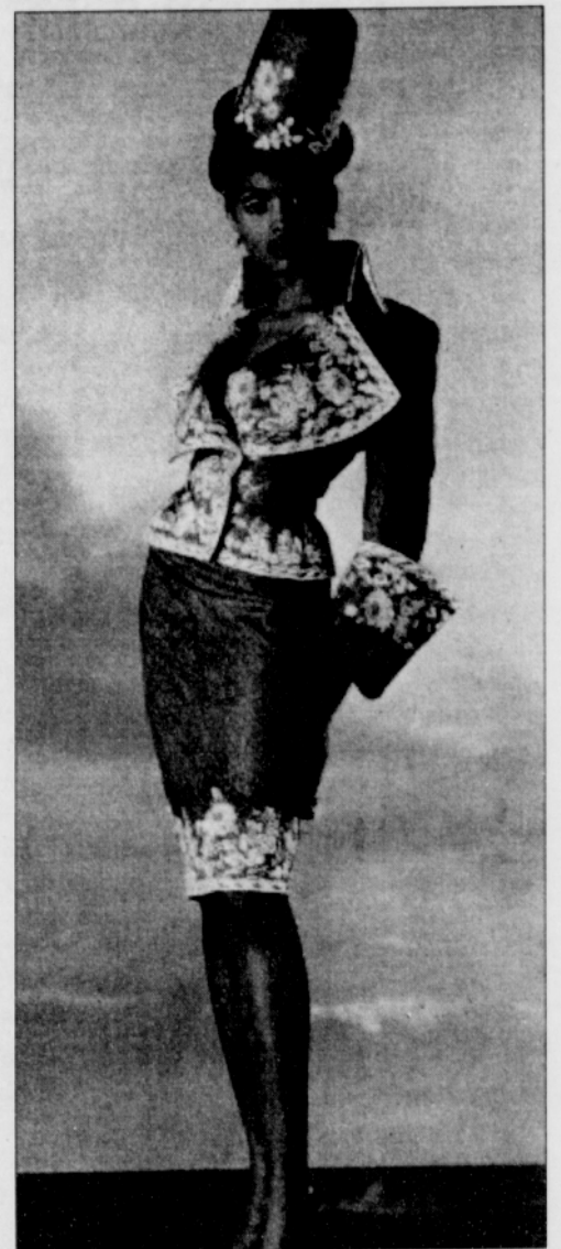
Givinchy adds new dimension to a denim suit with floral embroidered jacket, skirt and elongated hat.

NAAC_ - (locally and nationally); St. Vincent DePaul Child Development Center; Volunteers of America Fund; Portland State University; Multnomah Association for Retarded Children; United Negro College Fund (locally and nationally); American Cancer Society, Oregon Division; Kidney Association Of Oregon; U.N.I.C.F. Ethiopian Aid (Africare, Inc.); American Heart Association, Oregon Affiliate, Inc.; Kerr Young Parent Program; Portland Dance Academy Scholarship; Head Start; Peninsula Little League; and many other groups and organizations.