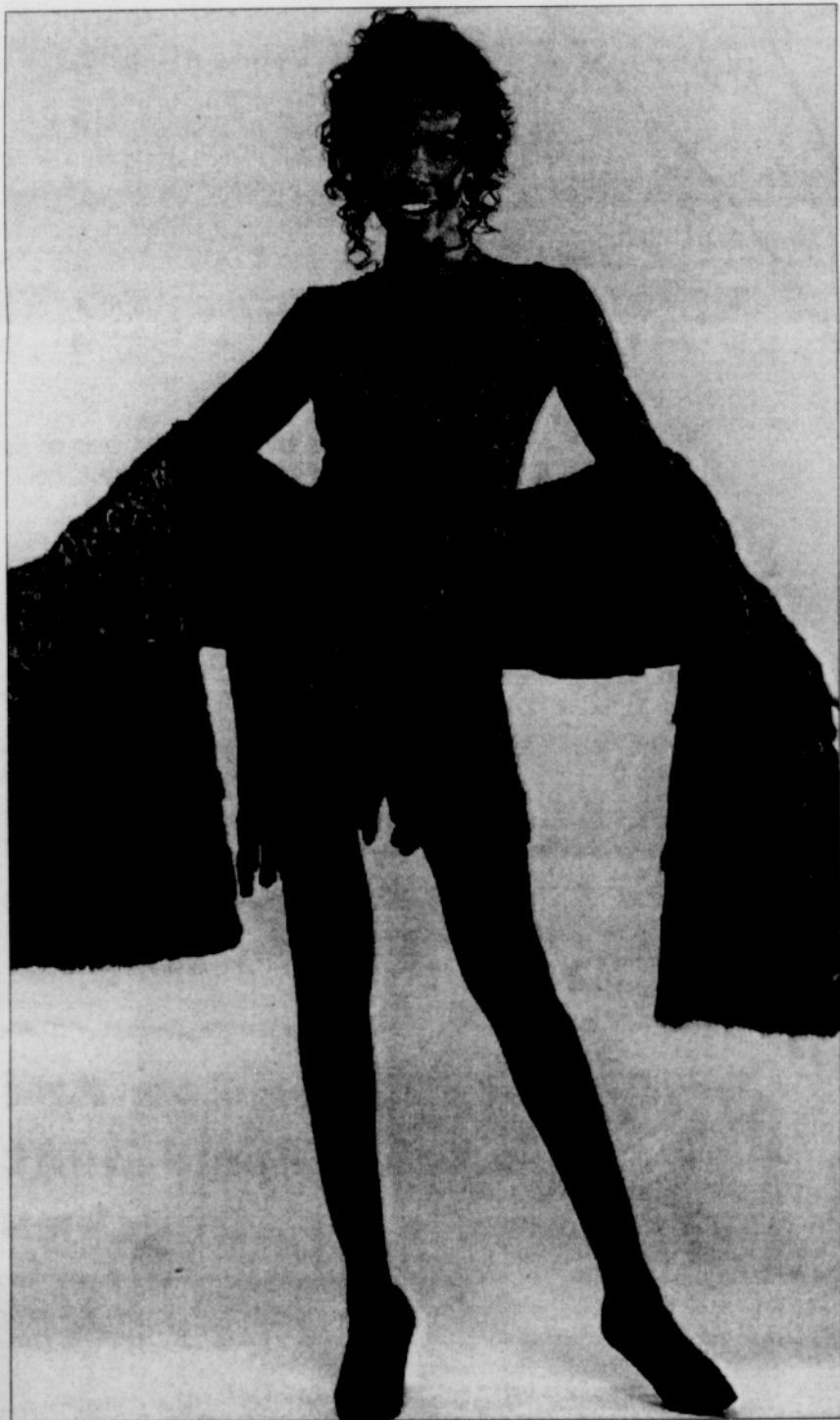
Balestra's jagged hem velvet leopard print dress has long, fitted sleeves and matching stole.