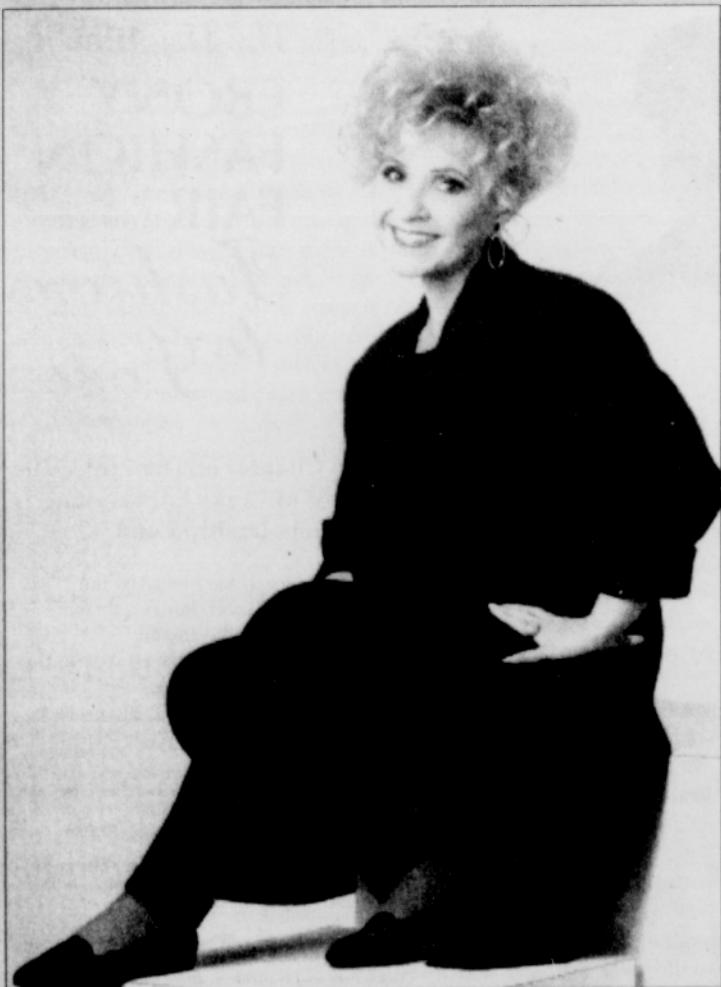
Brenda Lee will return to Chinook Winds Casino for three exciting performances April 16 & 17.

Ray Charles, the best known, best loved and best man of soul will perform at Chinook Winds Casino April 30 & May 1.