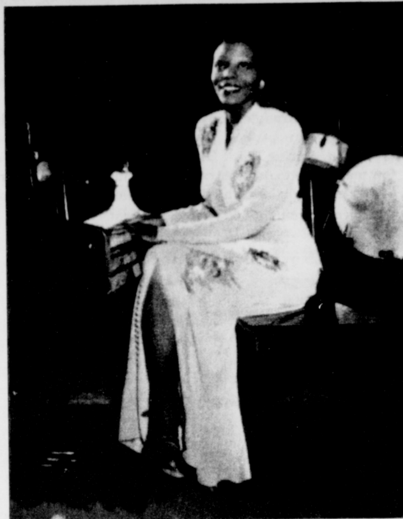
Mary Lou Williams (1910-1981) - Mary Lou Williams was known as "the First Lady of Jazz" and described by Duke Ellington as "perpetually contemporary".

Each session will run from 1-3 PM and will be held at VESSELS, at 2605 NE Martin Luther King Jr. Boulevard, corner of Russell. The cost is $5 per person. Seating is limited; reservations are required, by calling 503/249-1952. The grooms-to-be are admitted free! The workshop will feature details