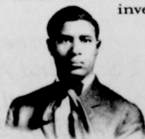
GARRETT A. MORGAN INVENTOR

Month. Without them, our world would be a very different place.