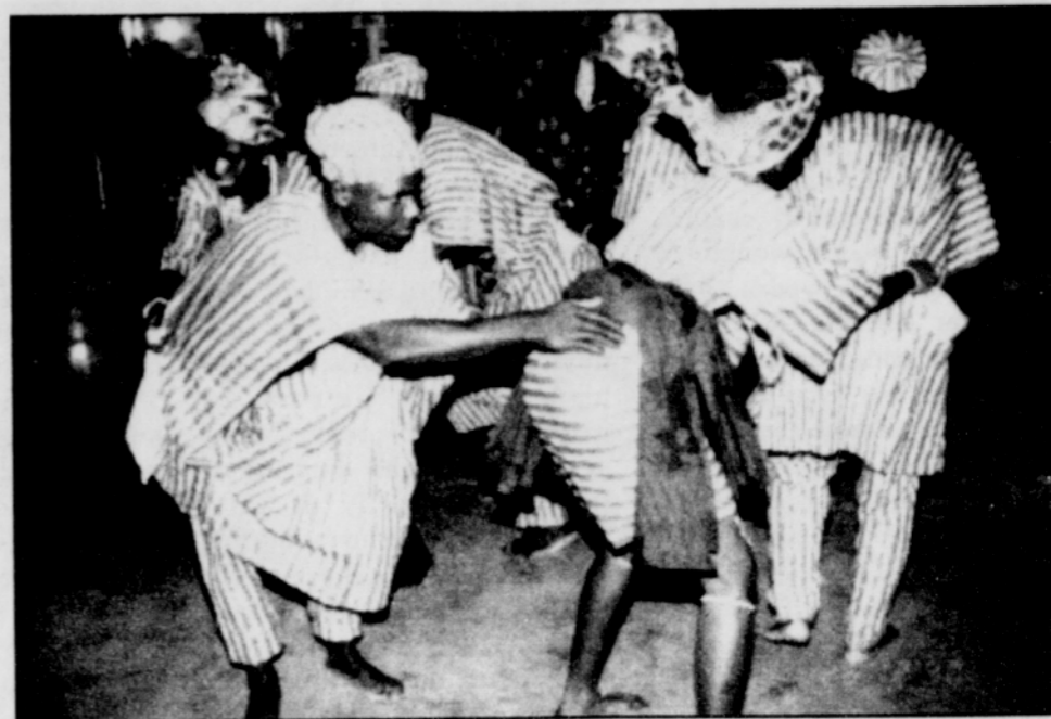
A Dance Celebration in Ghana, Africa.

The Northwest African American Writers Workshop (NAAWW) will host a Black History Month poetry celebration February 13 at the North Portland Branch Library (512 N Killingsworth) from 3 to 5 PM. The celebration will also serve