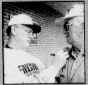
See Sports, page B2.

No, it's not the Stupor Bowl any more, the game finally has come of age.