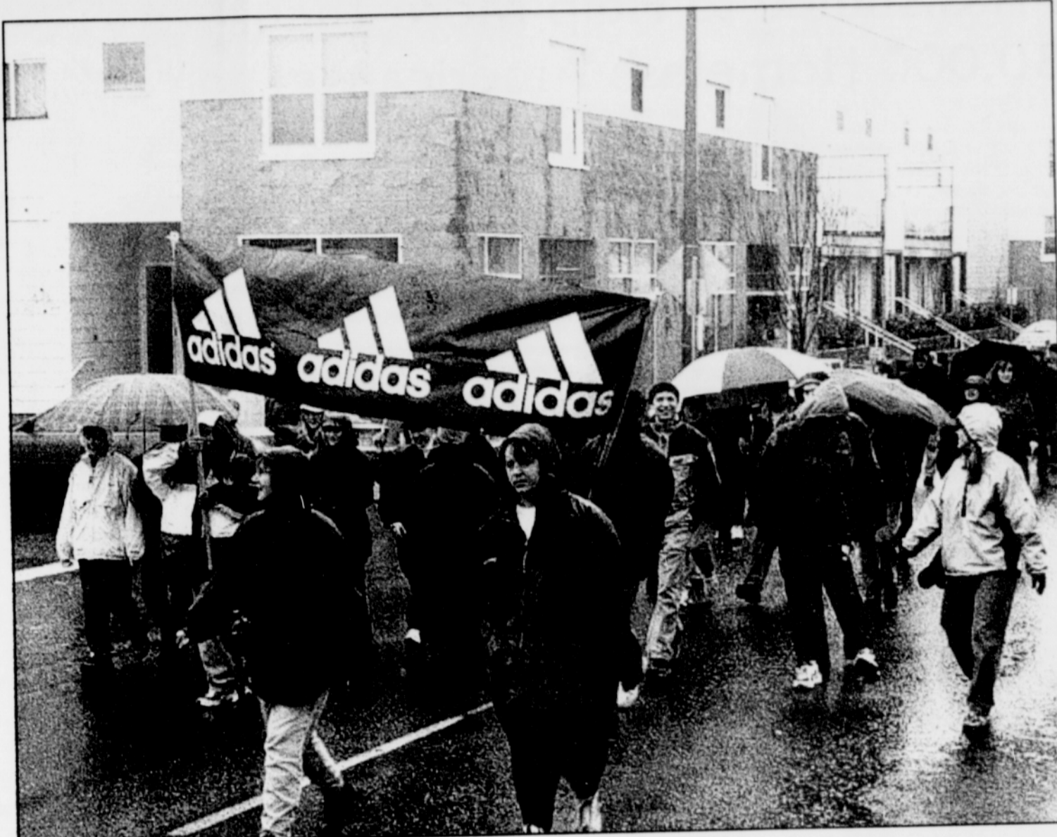
MLK "Wellness March" Celebration, was a Community Call To Action for the values outline by the late Martin Luther King, Jr. The rain didn't dampen the spirits for commitment to participate.

“..w i l l n o t b e j u d g e d b y t h e c o l o r o f t h e i r s k i n b u t b y t h e c o n t e n t o f t h e i r c h a r a c t e r B e l i e v e y o u r d r e a m e v e r y d a y.