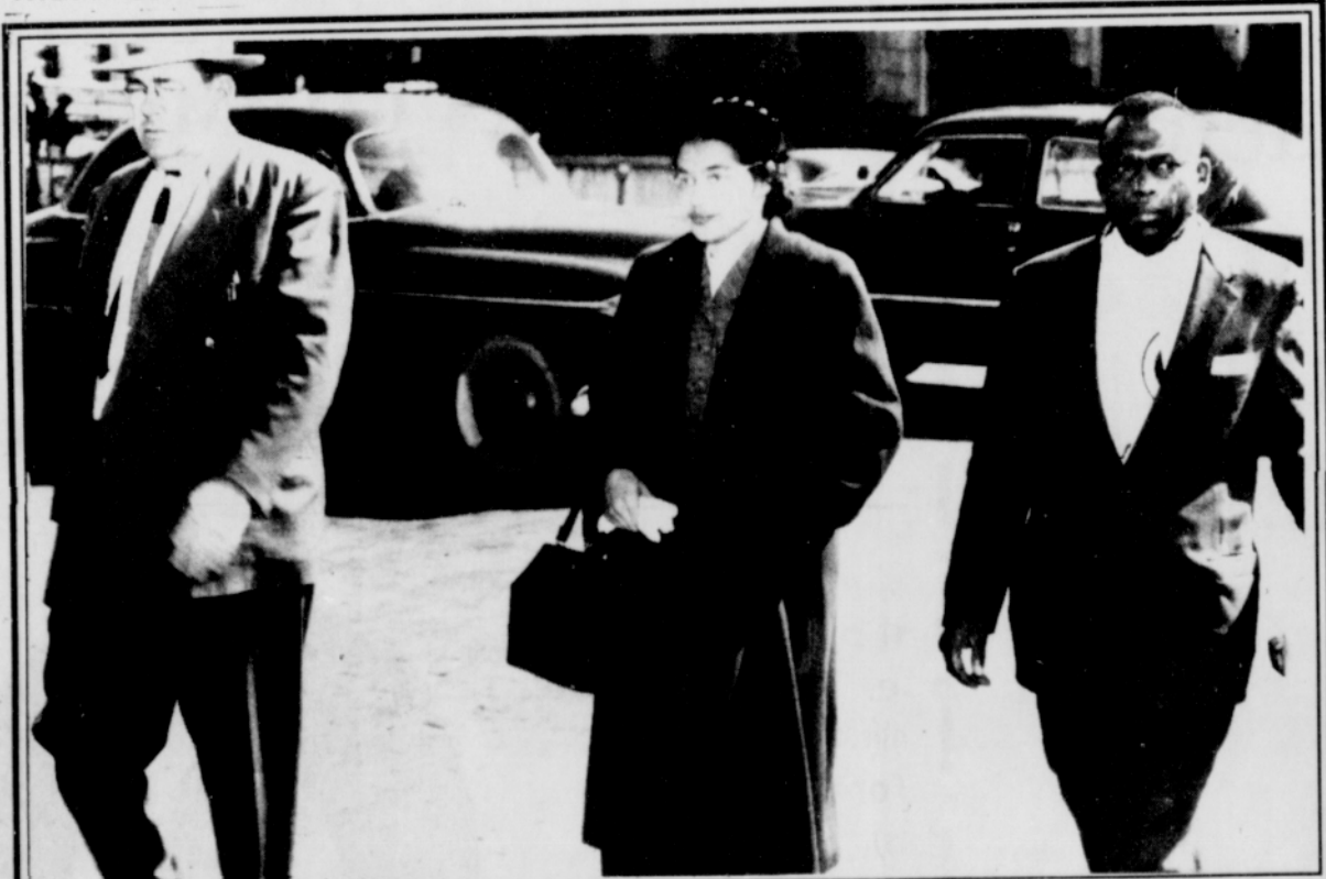
Rosa Parks, flanked by her attorney and a deputy, on her way to the jail. Parks refused to move from her up-front seat on a bus in Montgomery, Ala. in 1955.