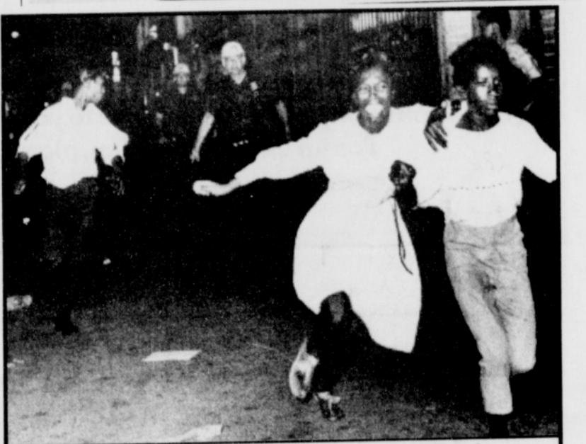
Violence erupted during a protest in Memphis, a week before Martin Luther King Jr. was assassinated there.