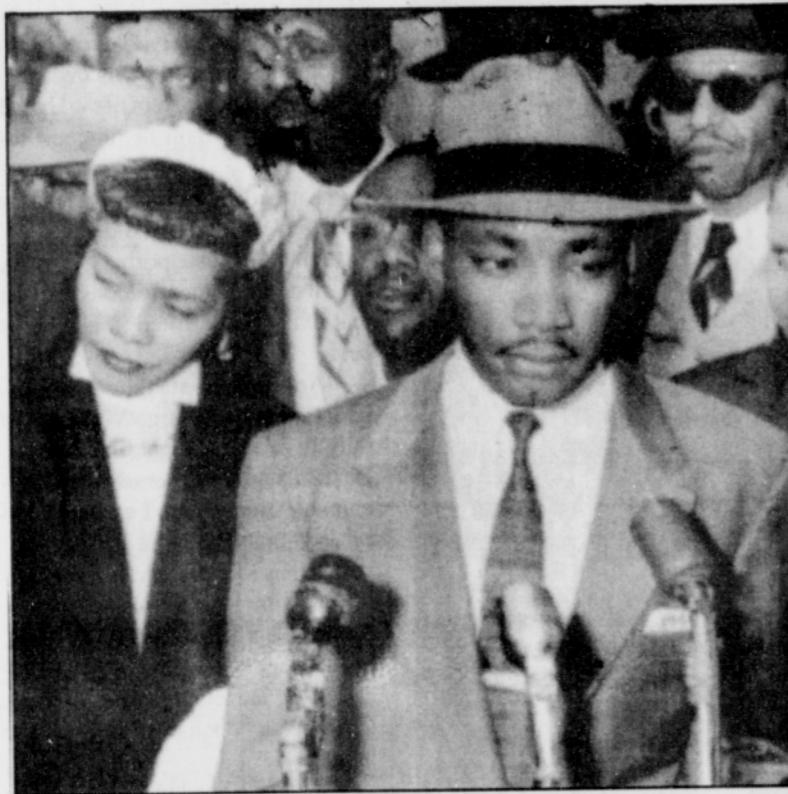
King and his wife, Coretta, meet with reporters on the steps of the Montgomery County Courthouse before his trial in March 1956 for violating a state law forbidding boycotts.