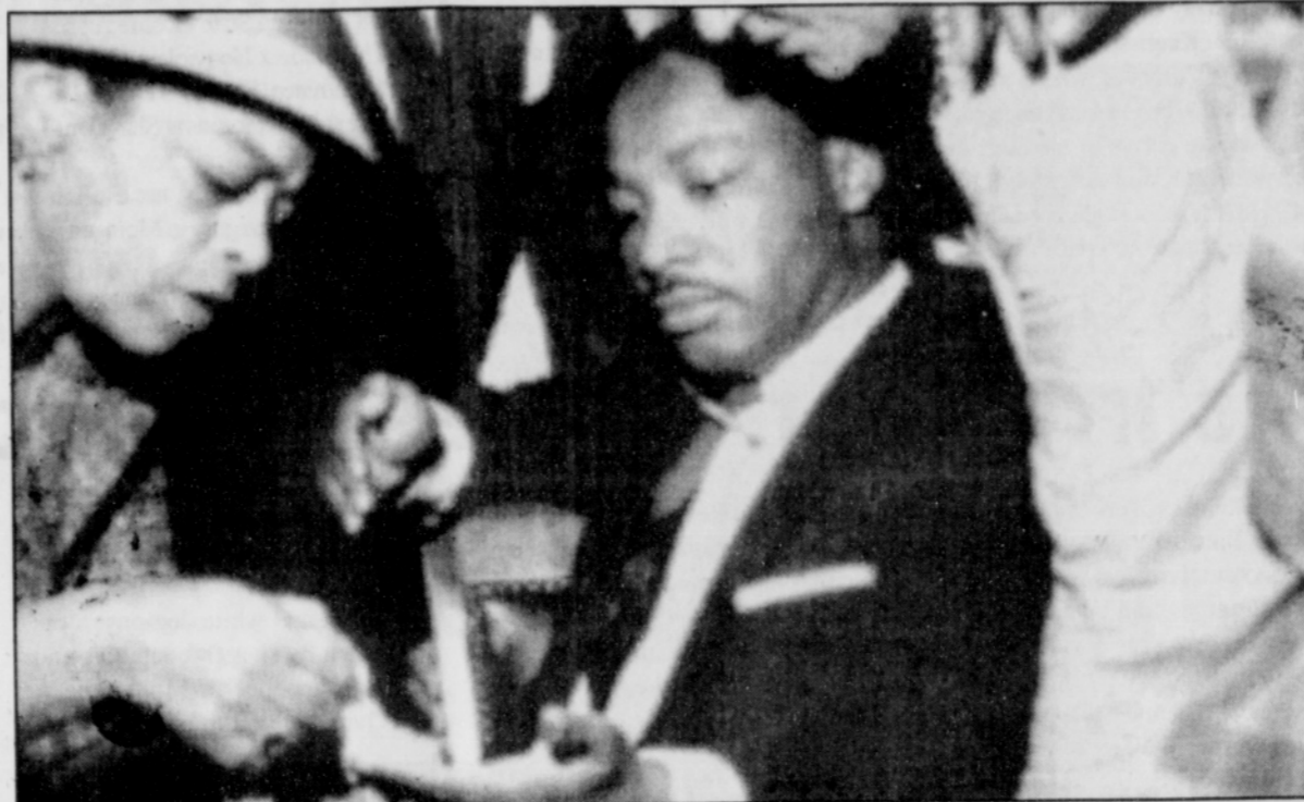
King waits for an ambulance moments after a deranged woman stabbed him with a letter opener at a New York store in Sept. 1958. He later referred to this incident in his speeches whenever he was preoccupied with death.

The first day of the bus boycott. The trial for Mrs. Prks. A meeting of movement leaders is held. Dr. King is unanimously elected president of an organization named the Montgomery Improvement Association, a name proposed by Reverend Ralph