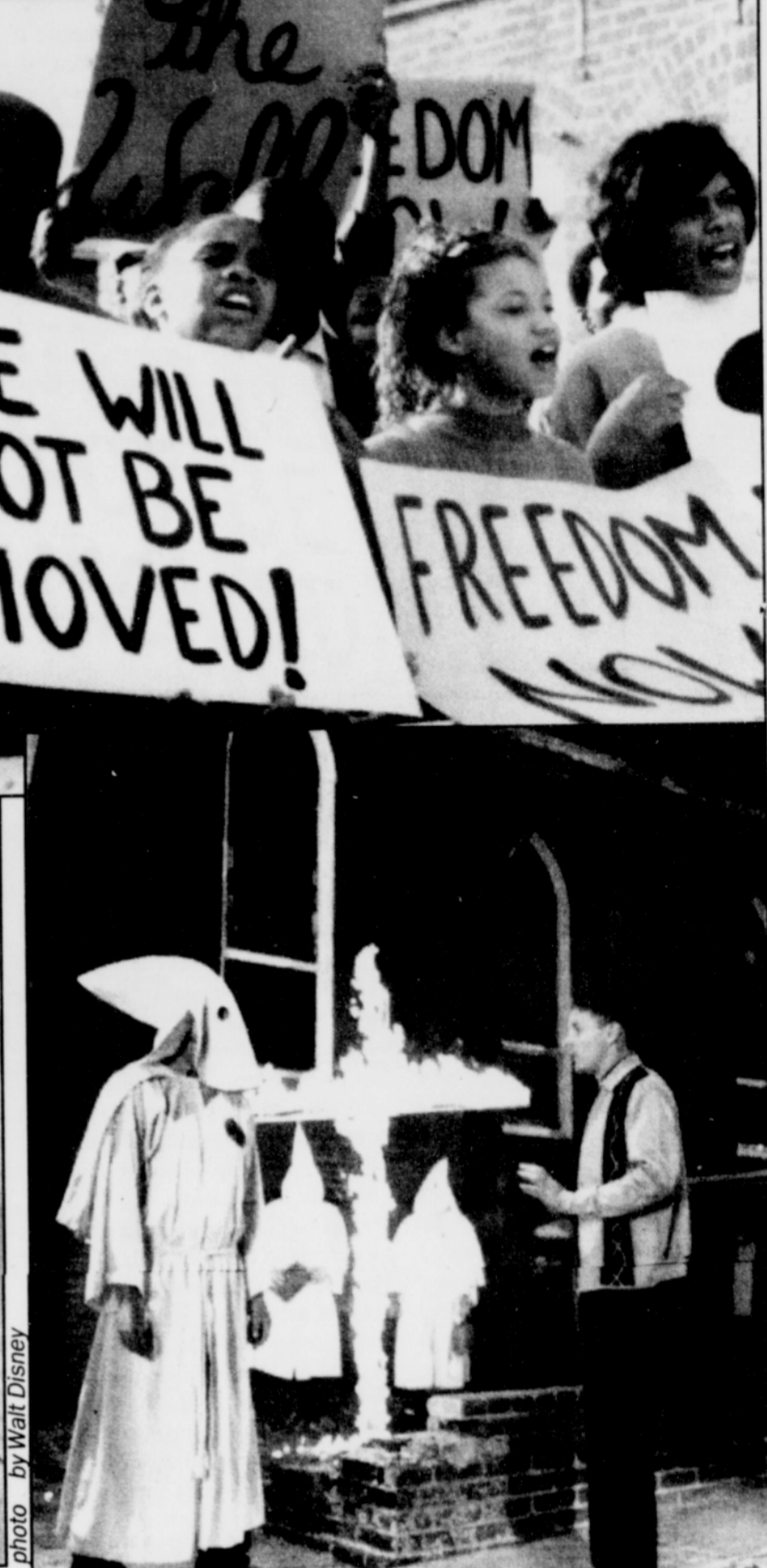
"Selma, Lord, Selma" is a new movie on the American civil rights movement of the 1960s.