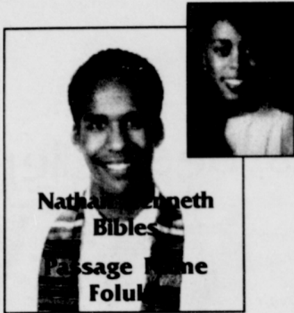
Nathaniel Kenneth Bibles Passage Name Foluke

"The program is important because you learn from men what it means to be a man."