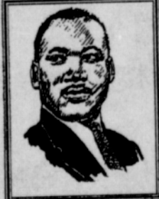
Dr. Martin Luther King, Jr.