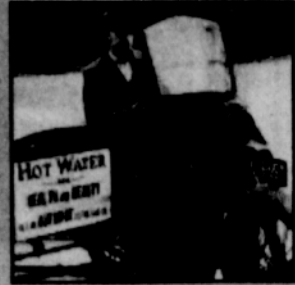
See Metro, Section B.

NW Natural Gas Celebrates its 140th Birthday, Oregon's second-oldest locally owned company.