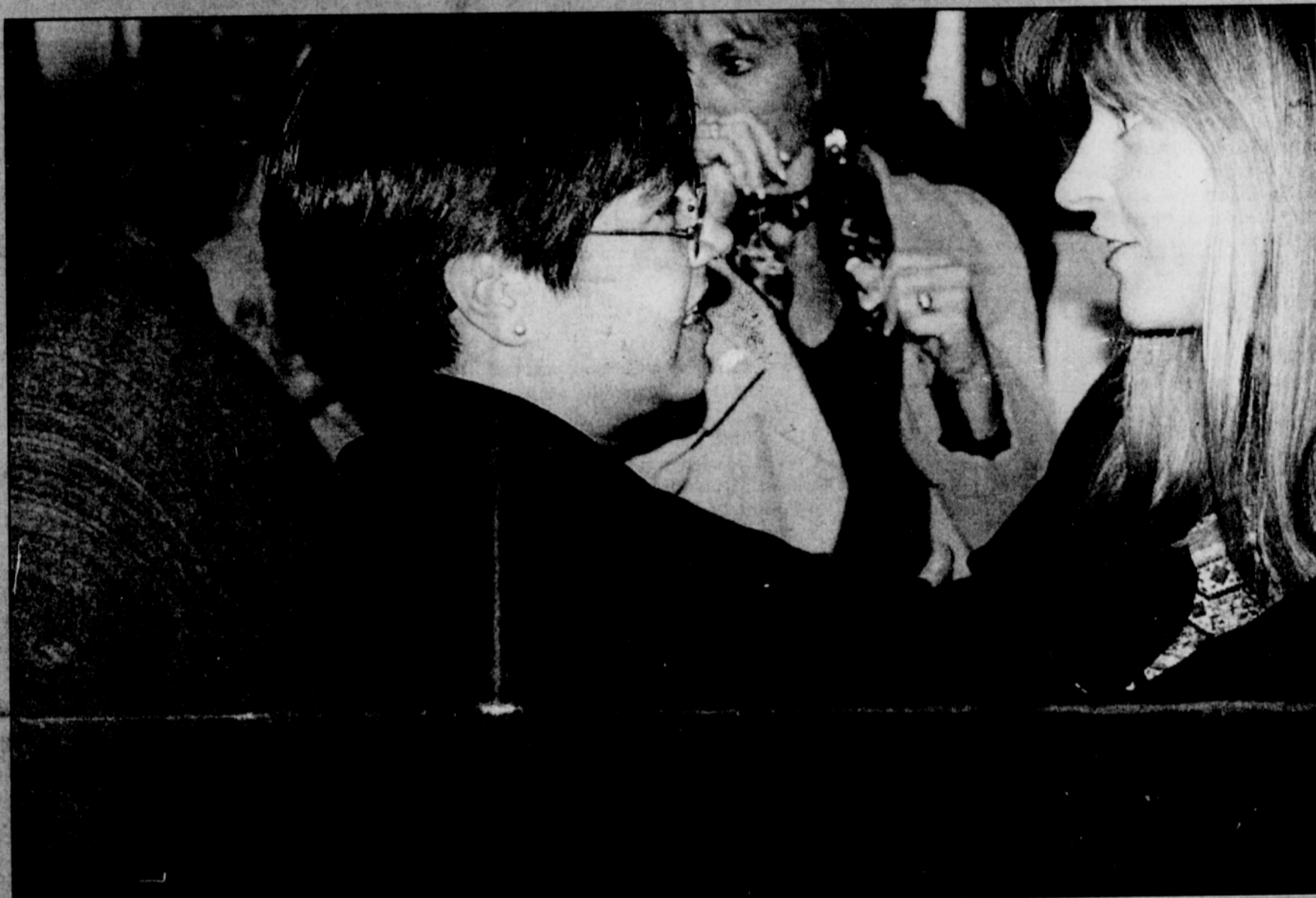
Serena Cruz was officially recognized as the Multnomah County Commissioner for District 2 representing Northeast Portland.