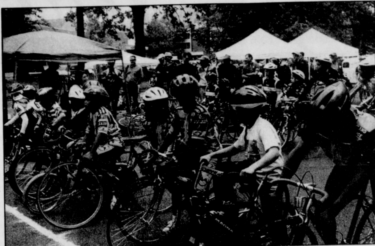
Children from Bicycles and Ideas for Kids

Spandex aren't in style for adolescents, but for kids on b.i.k.e. lycra shorts are "In Vogue". The team jerseys carry more in terms of pride