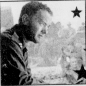
"Private" moment: Tom Hanks in "Saving Private Ryan"