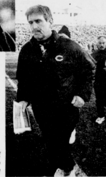
(Right) Dave Wannstedt taking his last walk off of the Chicago Field

Erickson was fired as coach of the Seattle Seahawks Monday after an 8-8 season left the team out of the playoffs for the 10th consecutive year.