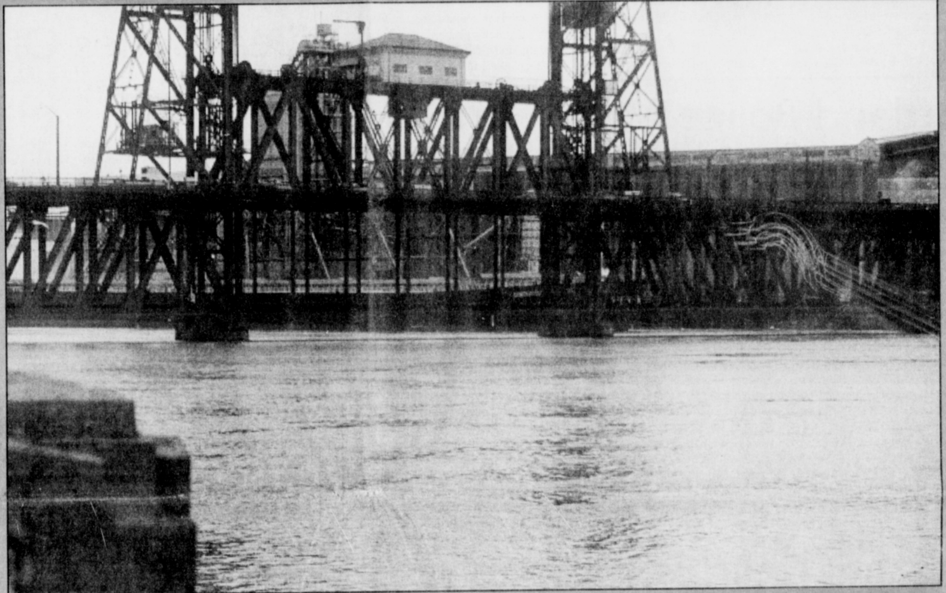
13 of Oregon's Rivers go on flood watch, as heavy Rains & Melting Snow threaten to test the limits of the Rivers' Banks.