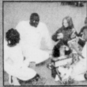
See Metro Section

Concordia University's second annual Christmas program for the children at Lutheran Inner City Ministries.