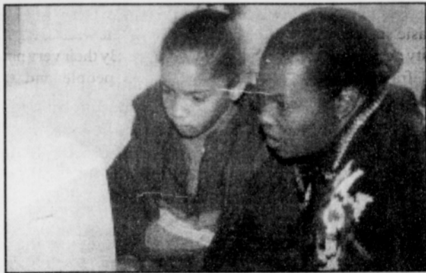
Its never too early to start. A young resident of McCoy Village is eager to learn computers.

When McCoy Village rose like a phoenix from two empty weed-infested blocks in Northeast Portland' predominantly African-American community, it was hailed as a positive and creative low-income urban housing solution. Now, with the opening of McCoy Village's Safeco Computer Lab and Learning Center, its residents have a cyberspace ticket to greater income and academic achievement.