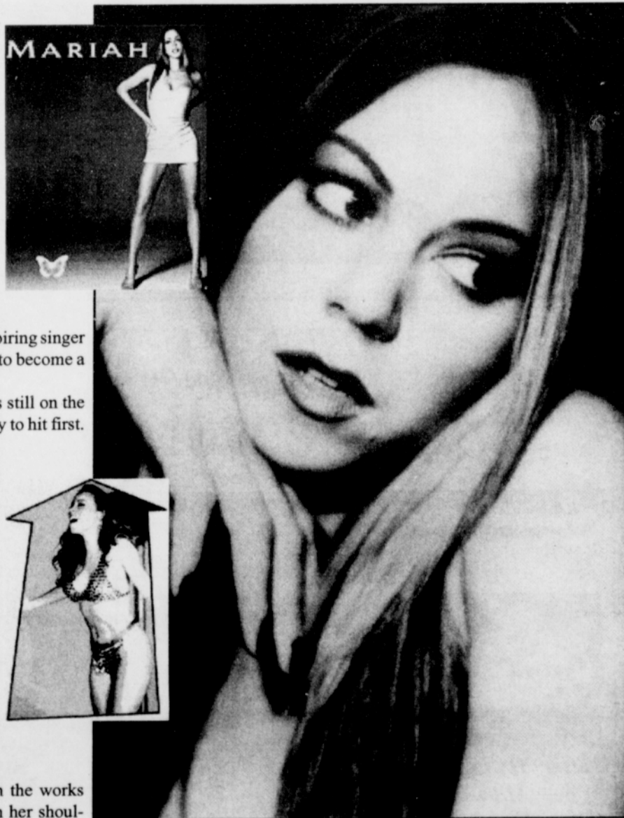
Having a lasting need and desire to sing. That's what fuels pop diva Mariah Carey

With two movies in the works and an super album on her shoulders, Mariah is sure to keep things moving for all her lovings fans that anticipate whats next.