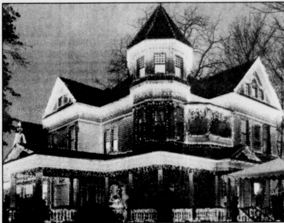
Enjoy a new holiday experience at the Queen Anne Victorian Mansion

CASA, an organization which trains and coordinates people to help represent abused, neglected, and abandoned children in the court system, will sell their Kids for Kids greeting cards. Daisy Kingdom will sell holiday ac-