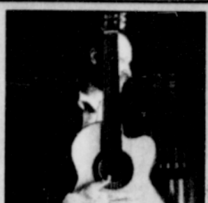
See Metro, Section B

Jazz artist John Scofield has been voted in many critics' polls as #1 electric guitarist for five years.