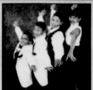
See Entertainment, page B3.

The Portland siblings are tapping thier way to the top and into the hearts of many.