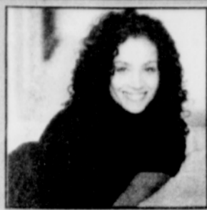
See Entertainment, page B2.

The Women of Def Comedy Jam are coming to the "Rose City" to laugh you out of your seat.