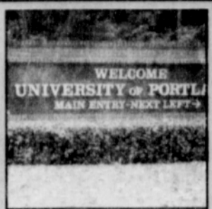
See Metro, Section B

University of Portland fall into conflict over institution expansion