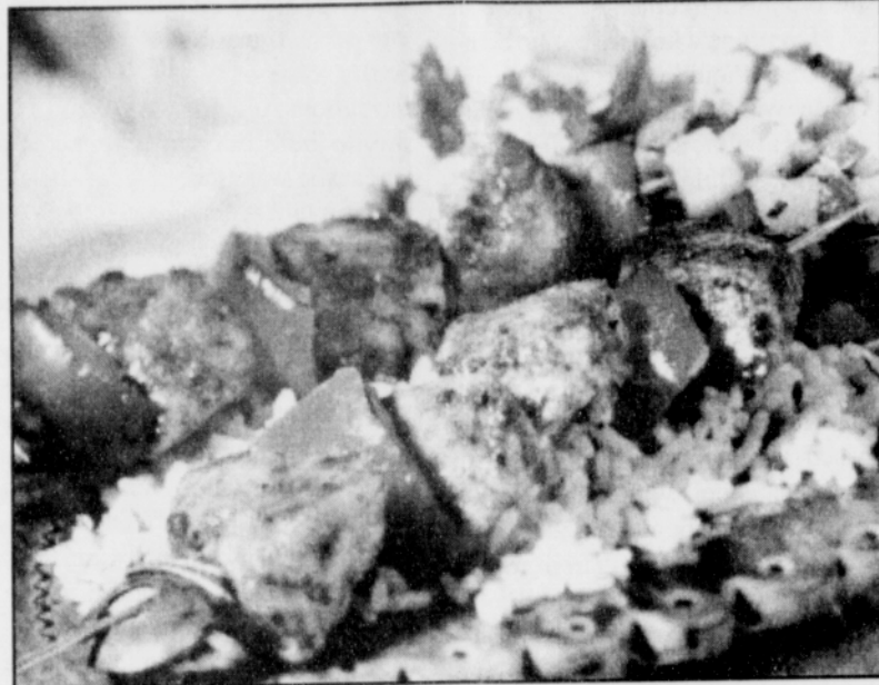
Turkey Cutlets with Raspberry Salsa

Kenneth Martis Merrillville, IN 1/2 cup reduced-fat mayonnaise 1 tablespoon horseradish sauce 1/2 cup plain bread crumbs 1/3 cup freshly grated Parmesan cheese 2 teaspoons Chef Paul Prudhomme's Poultry Magic 1/2 cup pancake mix 3-4 tablespoons butter or margarine 6-8 Butterball Fresh Turkey Cutlets Salsa 2/3 cup mild salsa 1 10-ounce package frozen raspberries, in syrup, thawed and well drained