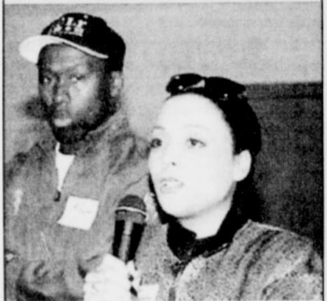
Al & Jacki Joyner at a recent athletic press conference.

Ten years ago, she became the fastest and flashiest female sprinter in history, reordering record books and fashion styles. Monday, the sports world was stunned by the death of Florence Griffith Joyner at 38 in Mission Viejo, Calif.