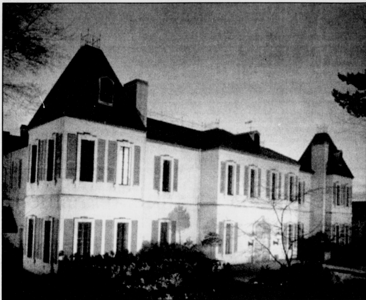
Just one of many beautiful scenes in Portland

The Portland Housing Center will offer a seminar on understanding home equity loans. Homeowners and all members of the community are invited to participate and encouraged to attend.