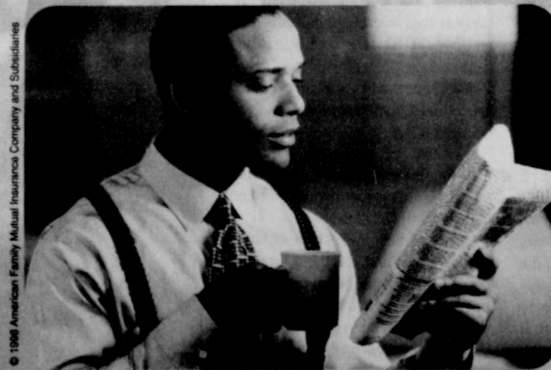
© 1998 American Family Mutual Insurance Company and Subsidiaries

Before you make your move, make one call and a helpful, friendly agent will be delighted to tell you more. Then go out there and conquer the world... we'll be right behind you.