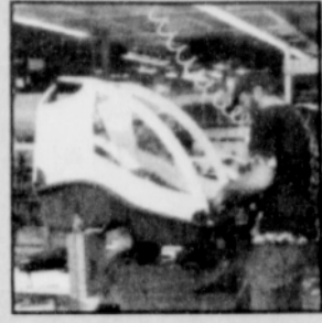
See Careers, page B4.

Come see some of today's top careers and where they may be going in the future!