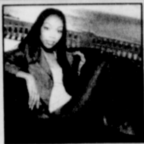
See Entertainment, page B3.

This 19 year-old has a new album out titled "Never say Never" and she's proving that it can be done again.