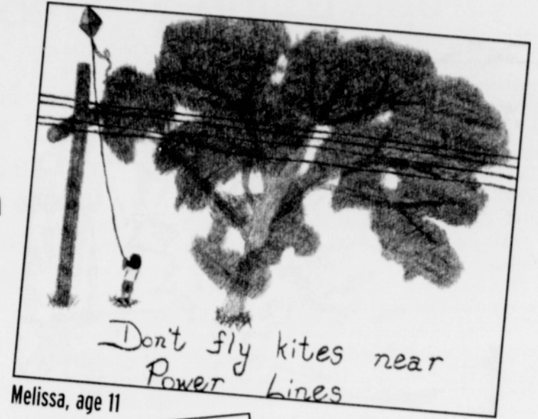
Melissa, age 11

Kites and balloons should be flown in open areas away from lines