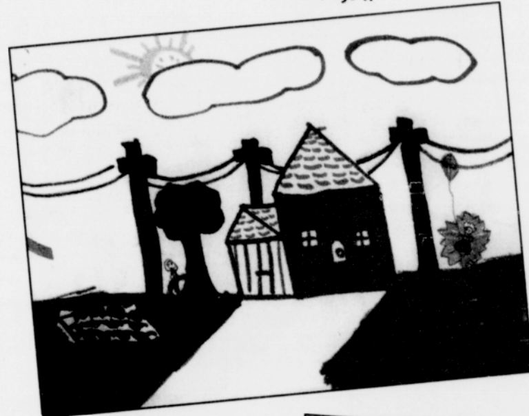
Mahala, age 7

Keep clear of trees or structures close to power lines