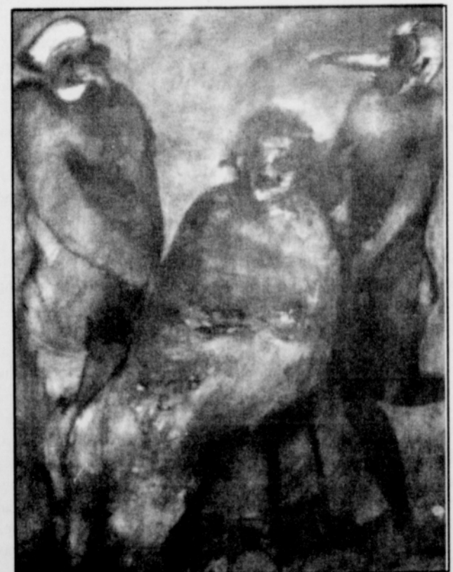
En la Casa de Locos Cortan Pelo (In the Madhouse They Cut Hair)