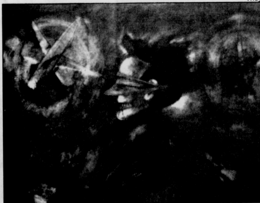
La Navaja (The Knife)