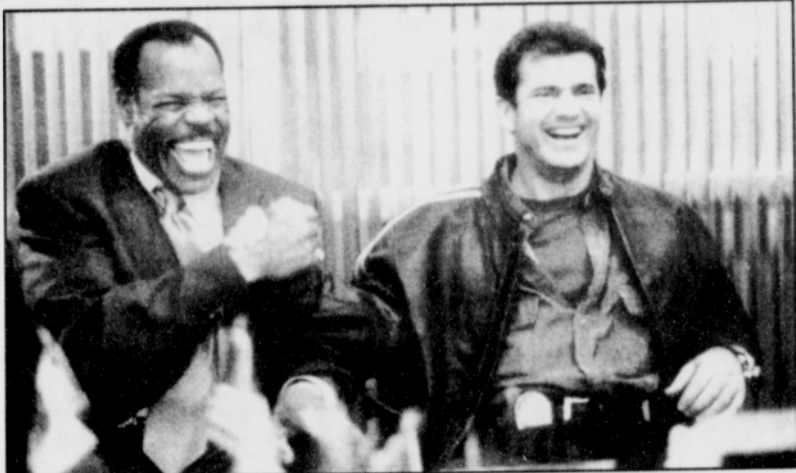
Danny Glover and Mel Gibson

Rarely has an action movie created heroes who connected so directly with the viewing public. The crowds who cheered "Lethal Weapon" felt as though they knew Riggs and Murtaugh personally—and they wanted to know them