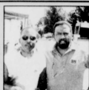
See Juneteenth, page B4

Juneteenth was celebrated in Portland this weekend with pride. Come see how Portland Celebrated!