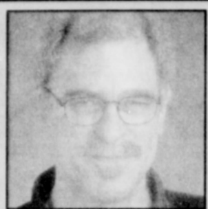
See Sports, page B2.

Chicago say's good-bye to one of the NBA's most respected coaches.