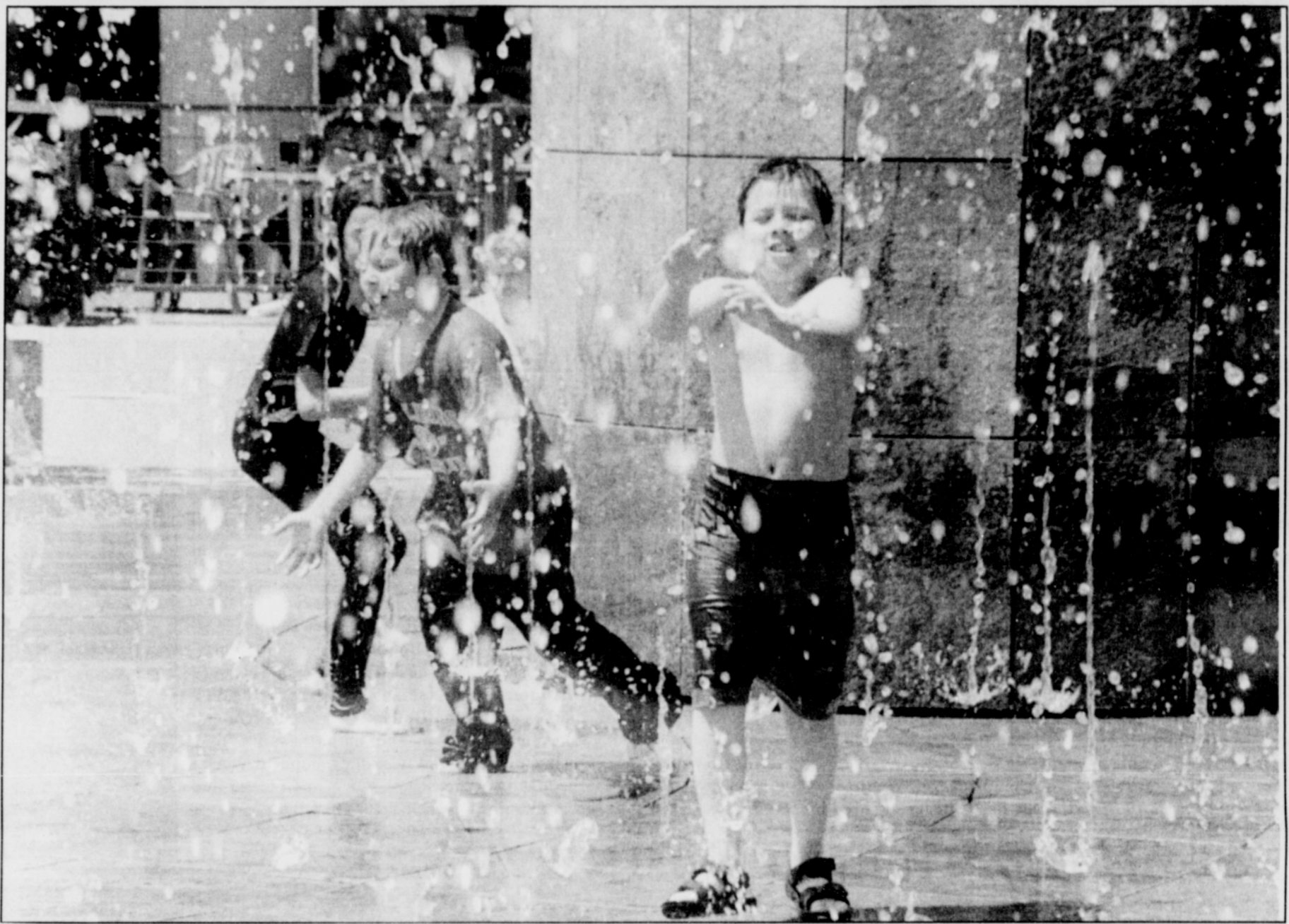
With all the heat Portland experienced last week, children swarmed to the Rose Quarter fountain and ran all around trying to capture little globs of water as they shot out of holes in the ground.