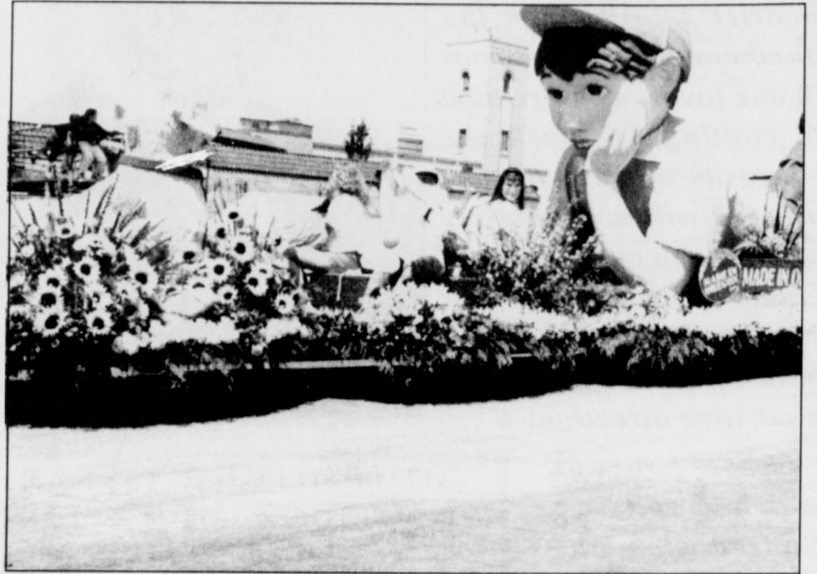
Portland's 90th Southwest Grand Floral Parade gave everyone something to "ooh"... and "aah" about.