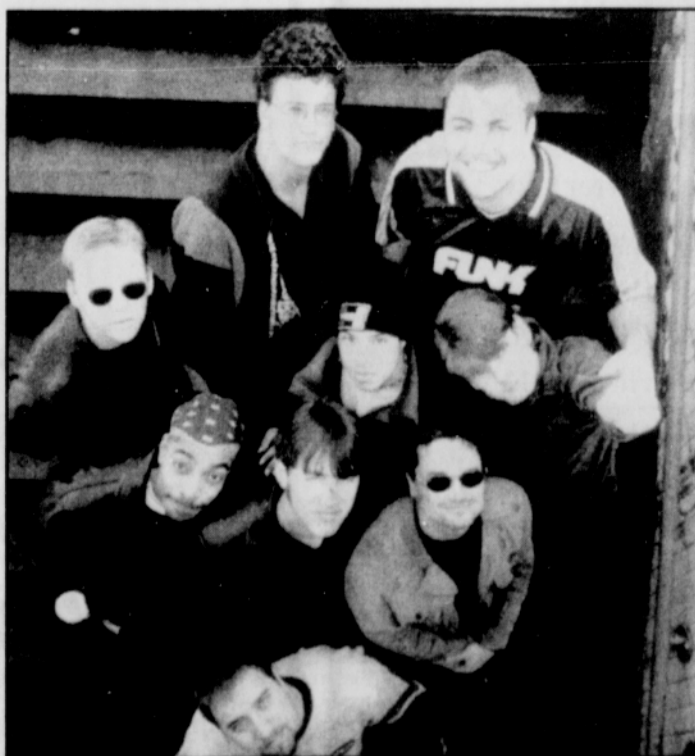
5 Fingers of Funk

Portland Observer AND JP's Custom Picture Framing and Gallery AND Studio 14 Invite you and a guest to any regular showing of 'I Got The Hook Up' Pick Your Complimentary Tickets at JP's or Studio 14.