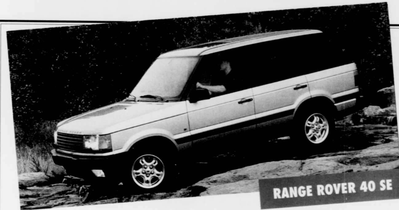
RANGE ROVER 40 SE

The performance is about to begin. Introducing the XJ8. With a resculpted interior, a new multiplex electrical