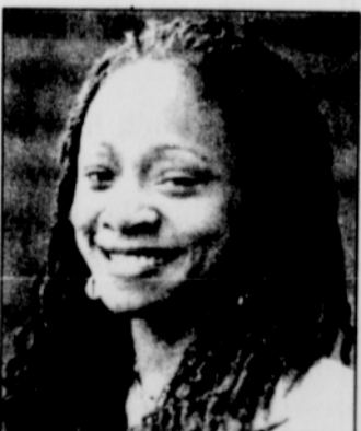
Chastity Pratt Reporter The Oregonian

DOUBLETREE HOTEL AT THE COLUMBIA RIVER 1401 N. HAYDEN ISLAND DRIVE