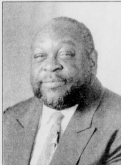
President Portland State University