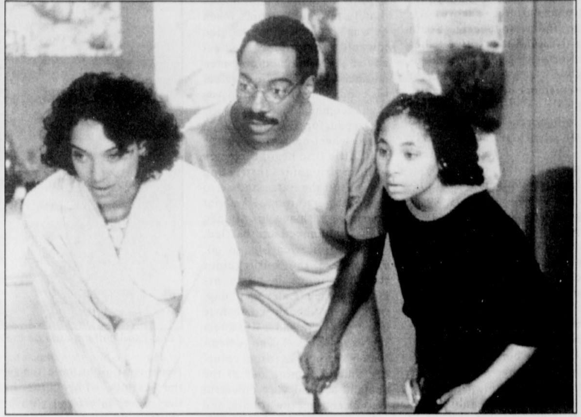
Lisa (Kristen Wilson), Dr. Dolittle (Eddie Murphy) and Charisse (Raven-Symone) watch as Maya's egg hatches.

A show business veteran, Raven-Symone who is now 12 years old, debuted her acting career at age 3 as the adorable "Olivia" on NBC's hit sitcom, The Cosby Show . Her television career continued as a series regular on ABC's Hanging With Mr. Cooper . Also, an accomplished singer and performer, Raven became the first young solo act to sign with MCA records at age 5.