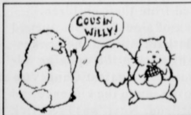
The woodchuck belongs to the squirrel family.