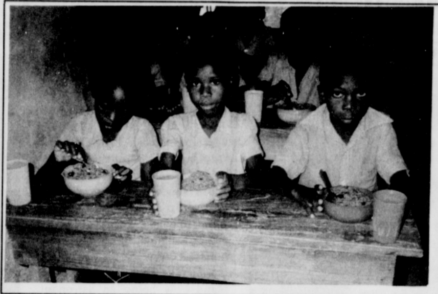
Nan Kolo Kindergarten children at lunch