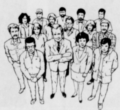
D. The People of Oregon

Luck has absolutely nothing to do with it. Instead, it's up to the people to decide. In 1984, Oregonians voted overwhelmingly to establish a state lottery, with profits directed to enhance economic development within our borders. In 1995, you voted again—this time to allow Lottery profits to help a public education system in need.