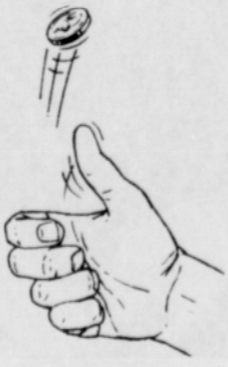
C. Coin Flip