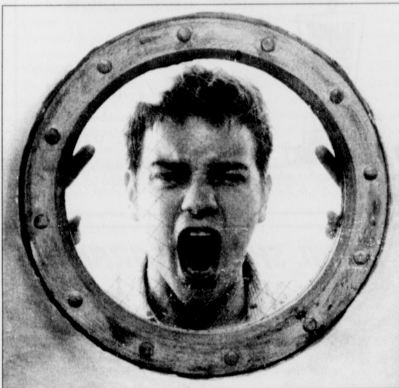
Ewan McGregor in Ole Bornedal's "Nightwatch"

A suspense thriller starring Nick Nolte, Patricia Arquette, Ewan McGregor and Josh Brolin, "Nightwatch" follows a young law student who takes a part-time job as a lone night watchman - just as a serial killer has begun to terrorize the city.