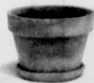
Yet to emerge

Oregon Lottery profits are available to go where they're needed, when they're needed. That's the beauty of it. In fact, this year alone, more than $350 million in Lottery profits are at work across Oregon. This includes $273 million for Oregon's public school and over $72 million for economic development programs. And in the future, Oregon voters can