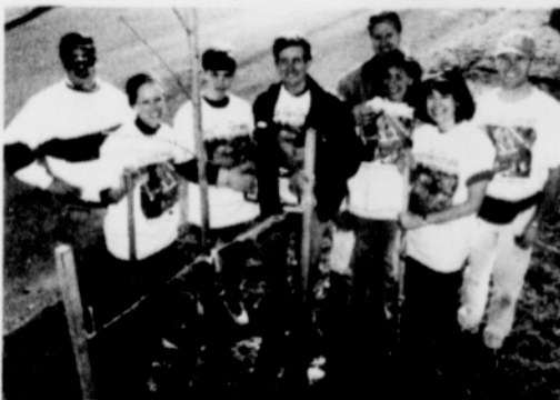
PGE helps Seed the Future at a tree planting in Portsmouth.